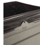
Patented Grab Bag™