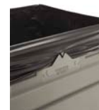
Patented Grab Bag™