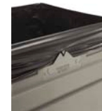
Patented Grab Bag™