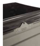
Patented Grab Bag™