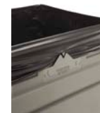
Patented Grab Bag™