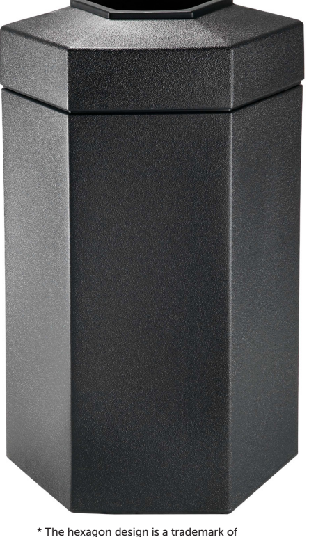
* The hexagon design is a trademark of Commercial Zone® Products

Email: cpservice@commercialzone.com Phone: 1.800.782.7273 2727 W. Good Hope Rd, Milwaukee WI, 53209 www.commercialzone.com