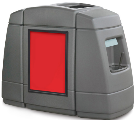
Amenity Unit, Tri-Fold Towels Single #75910599 and Double #75920599 Without Frame Single #75810599 Without Frame Double #75820599