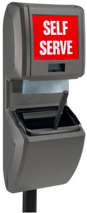
Pole-mounted WSC Item #750724099