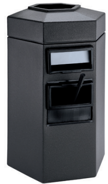
Single-sided Waste/WSC #755324 Double-sided Waste/WSC #755424