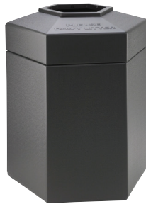
45-gallon Hex #737224