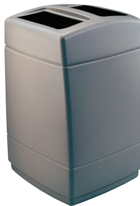
55-gallon Waste Container Item #732824